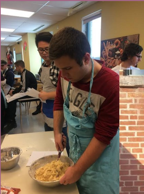
Cooking In Class