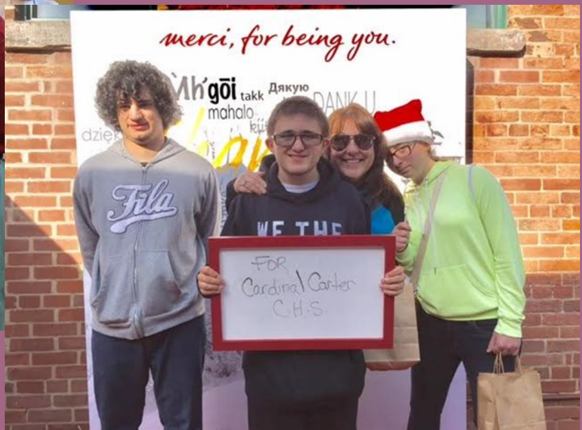
A Trip Downtown